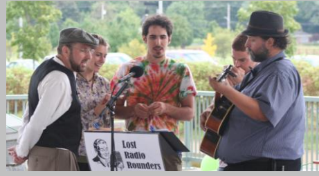
The Lost Radio Rounders and Almost Awake